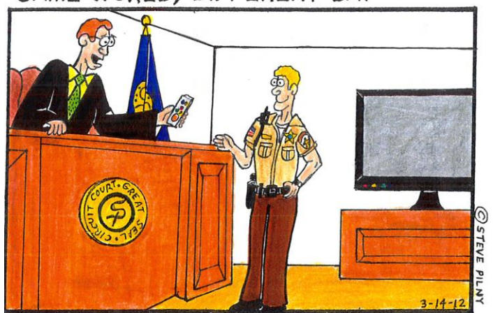
"NOW THAT OUR INITIAL HEARINGS WILL BE CONDUCTED VIA VIDEO... YOUR DUTY, AS THE BAILIFF, WILL BE TO OPERATE THE REMOTE."